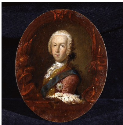
Fig. 6 Prince Charles Edward Stuart; 1740s; Sir Robert Strange – previously with Philip Mould & Co.

Robert Strange (himself an ardent Jacobite supporter who fought at the Battle of Culloden) also designed banknotes in preparation for Charles's victory and painted his portrait in miniature [Fig. 6]. Strange was appointed 'Miniature Painter and Engraver' to Prince Charles. In the same way as any monarch, Charles appointed an artist to produce miniatures he would present to his supporters.