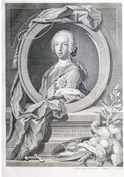
Fig. 5 Engraving of Prince Charles Edward Stuart; 1745; Sir Robert Strange – National Galleries of Scotland

march on London.[4] It's striking that in the headiest days of the uprising, in the midst of strategizing the coup that had been his life's aim, Charles was also thinking about portraiture.