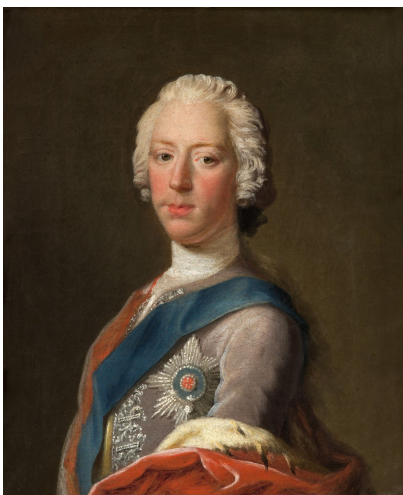
Fig. 4 Prince Charles Edward Stuart; 1745; Allan Ramsay – National Galleries of Scotland

Allan Ramsay was also training in Rome at this time. It was there he first met the prince in 1736, but it was a portrait he painted later - on the eve of the Jacobite uprising on 1745 (dubbed "the 45") - that would become a definitive image of Charles [Fig. 4].