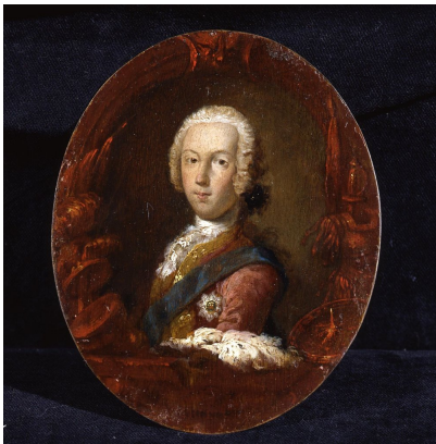
Fig. 6 Prince Charles Edward Stuart; 1740s; Sir Robert Strange – previously with Philip Mould & Co.

Robert Strange (himself an ardent Jacobite supporter who fought at the Battle of Culloden) also designed banknotes in preparation for Charles's victory and painted his portrait in miniature [Fig. 6]. Strange was appointed 'Miniature Painter and Engraver' to Prince Charles. In the same way as any monarch, Charles appointed an artist to produce miniatures he would present to his supporters.