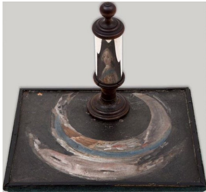
Fig. 10 Drinks tray with an anamorphic portrait of Prince Charles Edward Stuart – West Highland Museum, Fort William

Being small and portable, miniatures were one of the ways supporters could display allegiance to one another. They were also easily hidden, which was vital as being found to be a Jacobite was a treasonable offence. It is for the same reason that Bonnie Prince Charlie's portrait was sometimes disguised in an anamorphic image. One famous example being a drinks tray in the collection of the West Highland Museum, Scotland [Fig. 10].