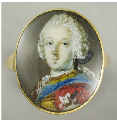
Fig. 11 Ring with a portrait miniature of Prince Charles Edward Stuart; c. 1745; British School – Royal Collection Trust

The most devotional of Jacobite portraits must be the miniatures set into jewellery [Fig. 11 and see also Victoria and Albert Museum 6-1899 ]. A portrait that is not only kept on your person at all times, but worn on the body, is significant of a fervent commitment to the cause.