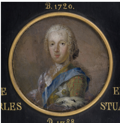
Fig. 8 Portrait miniature of Prince Charles Edward Stuart; c.1745; attributed to Sir Robert Strange – Royal Collection Trust

Interestingly, where the oil portrait and engraving do not show Charles wearing Highland dress or an element of tartan, many miniatures and other small scale paintings do [Figs 8 & 9].[5] The Highland dress signified the Stuart claim and aligned Charles with the Scots on whose support his campaign entirely depended. While the engraving was commissioned in anticipation of Charles regaining the throne, whence it would be widely circulated across the whole of Britain, miniatures were more personal objects, exchanged and kept by Jacobite supporters.