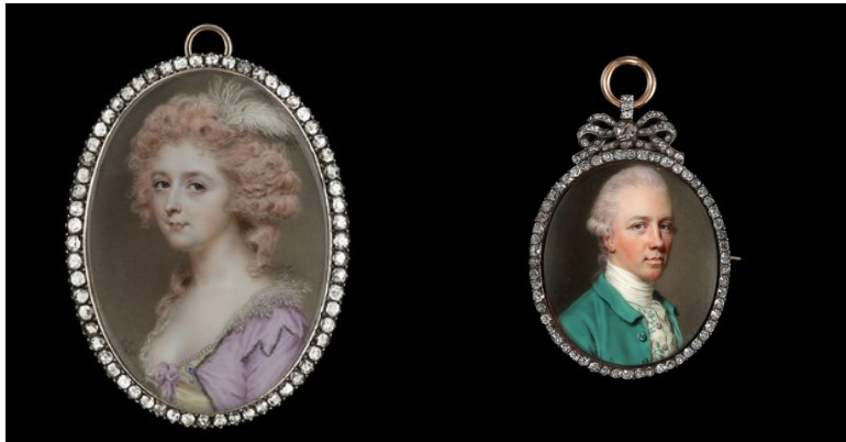
Fig. 6 [left]: John Smart, Portrait Miniature of a Lady , 1785, watercolour on ivory (54mm high) - sold by The Limner Company.