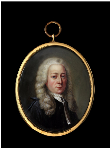
Fig. 5: Noah Seaman, Portrait enamel of a Professional , c.1730, enamel on metal (44mm high) - The Limner Company.

It was at the beginning of the 18th century that wigs began to be decorated with powder, too [17]. It was this development within the history of hair that provides us with some of the bright colours that we see in paintings and miniatures. Powder came in many different colours- off-white, pink, lilac, and shades of blue, and some of these colours would also be scented and have essential oils added to them. In fact, it has been suggested that these oils could naturally deter lice, and had more of a purpose than just vanity [18]. Such powder would be applied to the wigs, or straight on to natural hair, using a pair of bellows, with a mask used to protect the face from being coated.