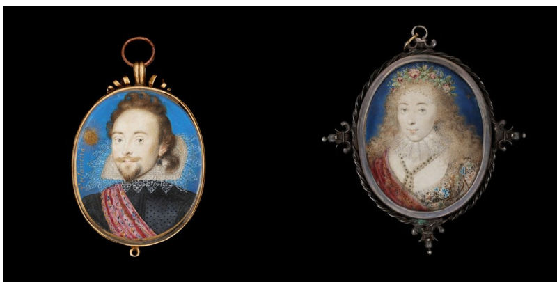
Fig.1: Isaac Oliver, Portrait of a Nobleman , c.1610s, watercolour on vellum (41mm high), previously with The Limner Company.