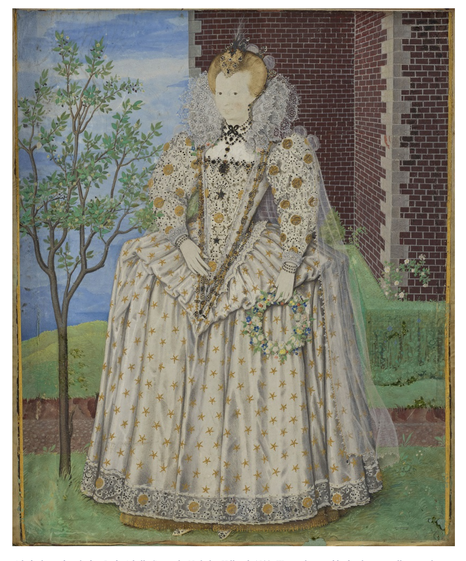
A lady, here identified as Lady Arbella Stuart, by Nicholas Hilliard. 1592. Watercolour and bodycolour on vellum, stuck down on card, 21.1 by 17.6 cm. (Private collection).