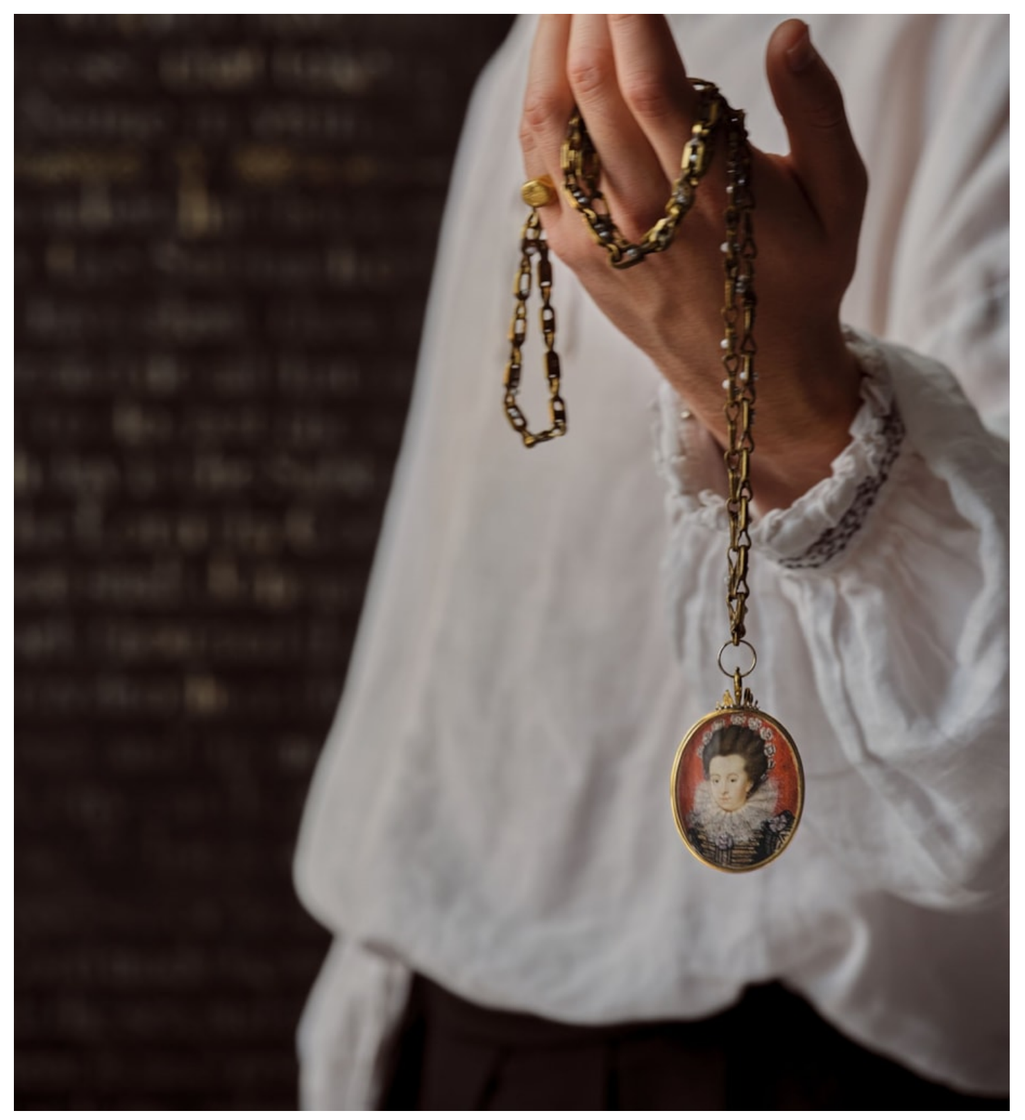
"Excellent...This show, like its subject, is small but perfectly formed" \( \subseteq \subseteq \subseteq \subseteq \subsete \subseteq \text{read review here} \)