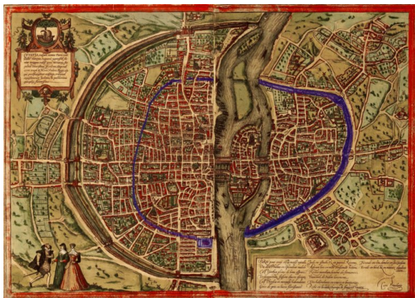
Fig. 2 Sebastian Münster, Map of Paris and its surroundings, 1572. In the lower right corner, Saint-Germain des Prés.

Sixteenth-century Paris was surrounded by city walls, built by Philippe-Auguste in the end of the twelfth century (Fig. 2 illustrated in blue). Within the walls, work and daily life were heavily regulated, whereas fewer rules applied outside the walls. This allowed foreigners, including Huguenots, to settle in the boroughs surrounding Paris, the most important one being Saint-Germain des Prés.